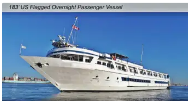
183' US Flagged Overnight Passenger Vessel